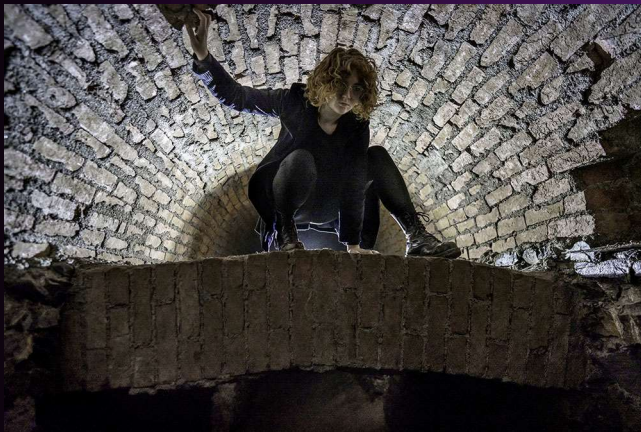
Finally I escaped

Genova, Staglieno cemetery