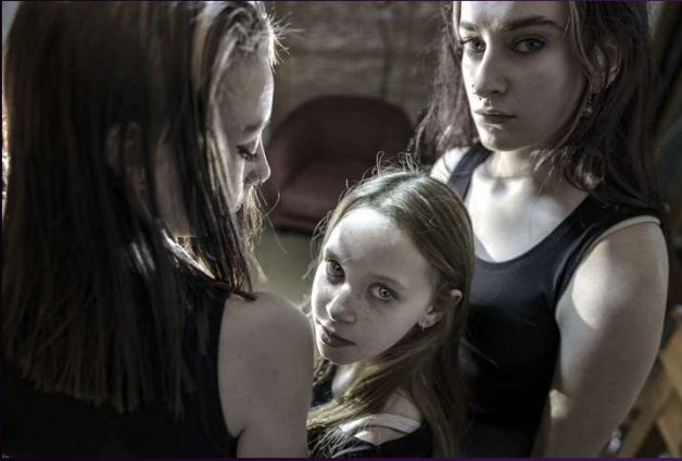
Thy will be done