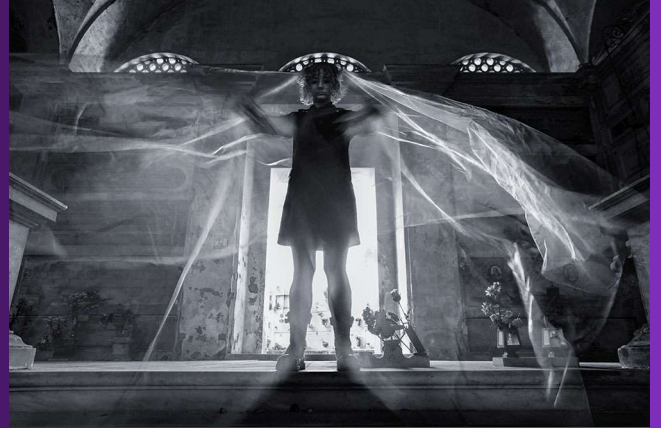
The Great Mith

Genova, Via Garibaldi